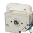
DG-2 DG-6 DG-4 DG-8